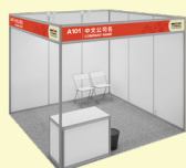
Standard Shell Scheme