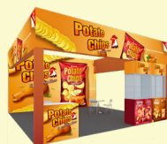
Premium Shell Scheme B