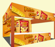
Premium Shell Scheme A