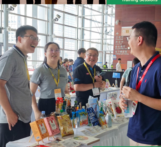
Supplier-Retailer Day Featured Products Showcase