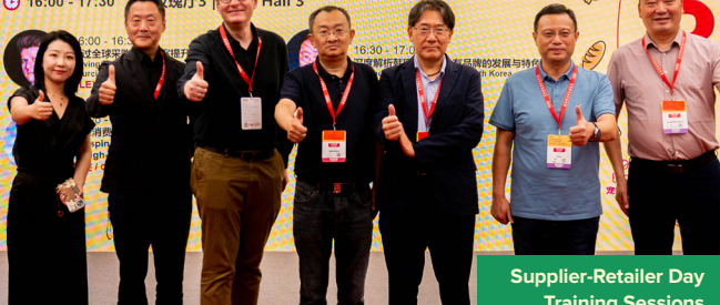
Supplier-Retailer Day Training Sessions