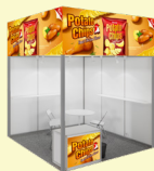
Upgrade Shell Scheme