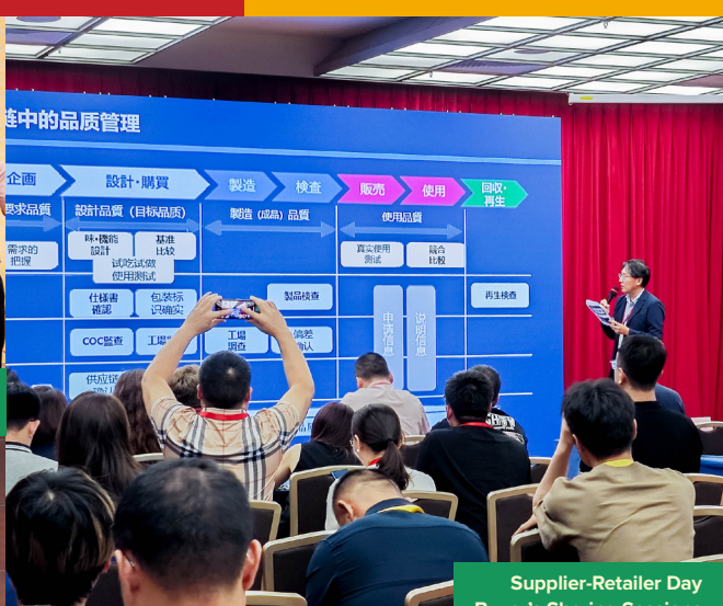
Supplier-Retailer Day Buyer's Sharing Sessions