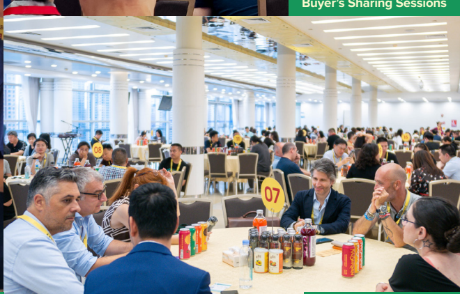
Supplier-Retailer Day Welcome Dinner